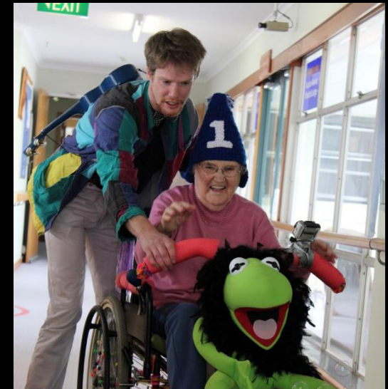
Image: Carnival of the Here and Now, Creative Tales.

Encouraging the sharing of wisdom and lifelong learning