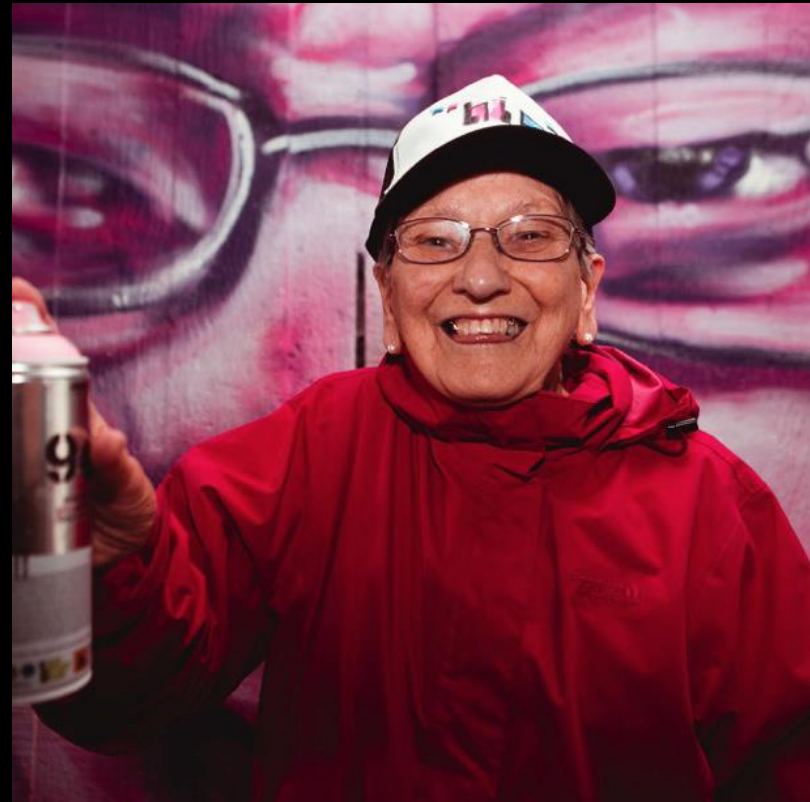
Image: Old Skool intergenerational graffiti project, 2013 Luminate, Scotland, Photo Eoin Carey

The arts offer a simple but multi-disciplined and cost effective way to nurture vibrant Age-Friendly Communities and give older people their creative voice and visibility.