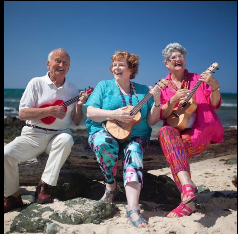
Image: 2015 Celebrate Creative Ageing Festival, Port Macquarie NSW

The arts bring people together in a welcoming, non-intimidating and creative environment, combating social isolation and forging essential links for people with their broader community.