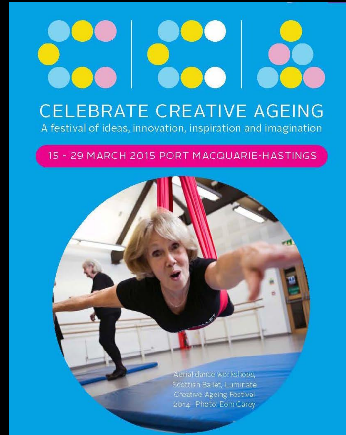
Image: 2015 Celebrate Creative Ageing Festival Program Port Macquarie NSW

Since 2013, the NSW Government has actively supported creative ageing initiatives including conferences, forums, and creative ageing festivals inspired by similar festivals in Ireland (Bealtaine), Wales (Gwanwyn) and Scotland (Luminate).